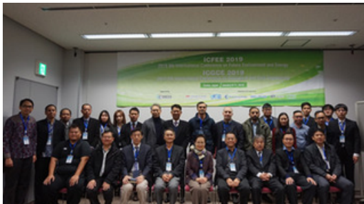
ICFEE 2019 -Osaka, Japan, January 9–11 IOP Conference proceeding (Volume 257) EI and Scopus Indexing