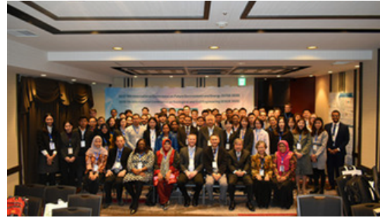
ICFEE 2020 -Kyoto, Japan, January 7–9 IOP Conference proceeding (Volume 581) EI and Scopus Indexing