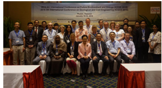
ICFEE 2018 -Phuket, Thailand, January 10–12 IOP Conference proceeding (Volume 150) EI and Scopus Indexing